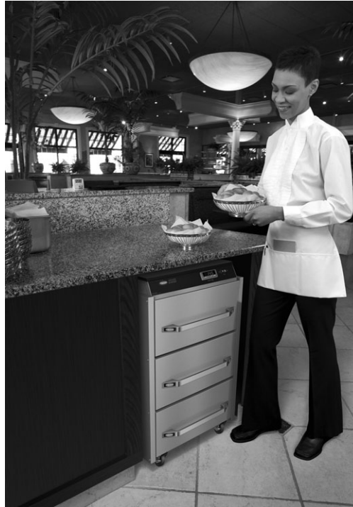
Model CDW-3N with low profile casters