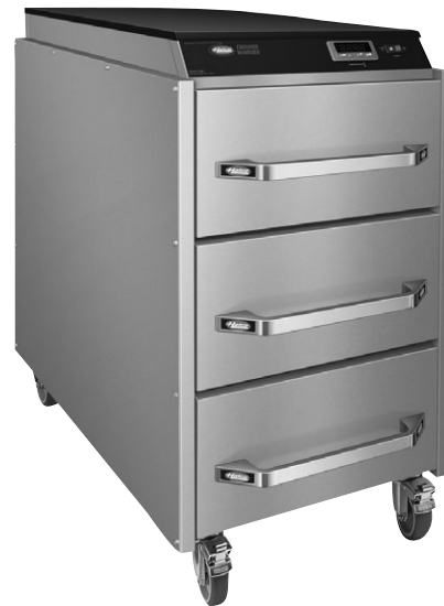
Model CDW-3N with low profile casters