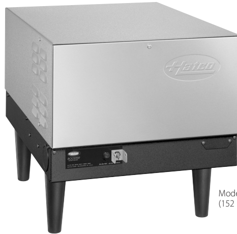
Model C-24 on 6" (152 mm) legs