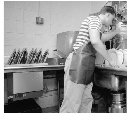
Water Temperature Recovery Table