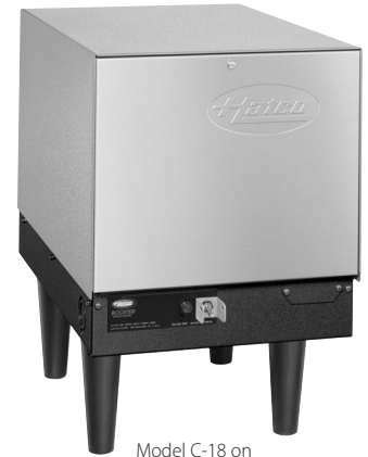
Model C-18 on 6" (152 mm) legs