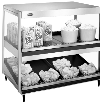
Model GRSDS/H-36D with slant shelf and horizontal shelf