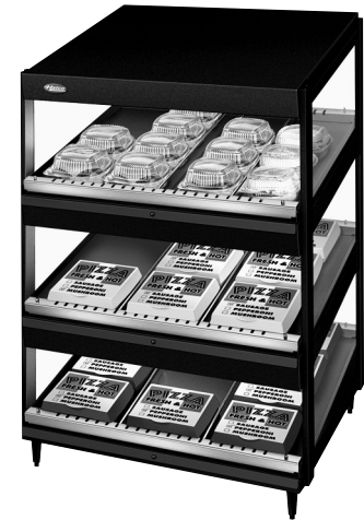
Model GRSDS-24T triple slant shelf in optional Designer black