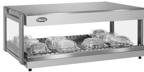
Model GRSDH-36 horizontal single shelf

Equipment On Signage Program Hatcographics.com