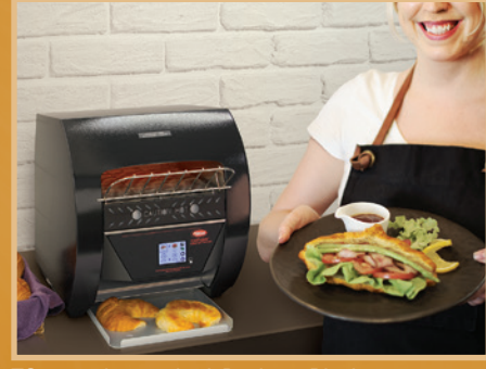
TQ3-400 in standard Designer Black pg. 4