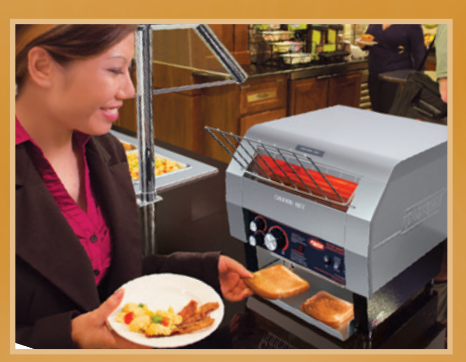
TQ-400 pg. 5