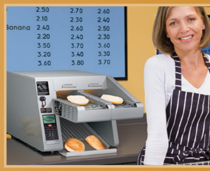
ITQ-1750-2C pg. 2