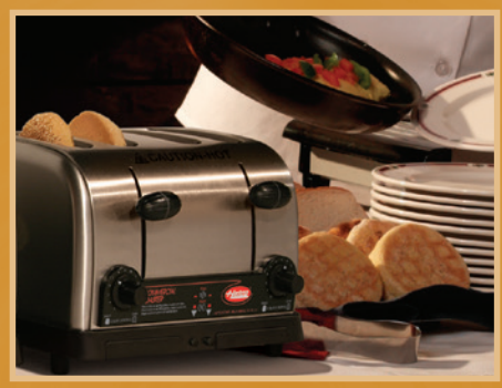
TPT-120 pg. 3