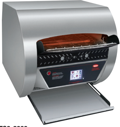
TQ3-2000 shown in optional Stainless Steel