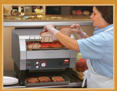
TQ-1800 pg. 5