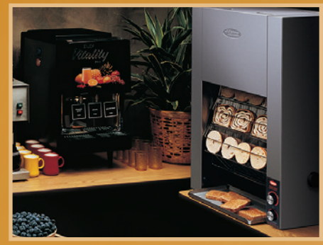
TK-100 pg. 7